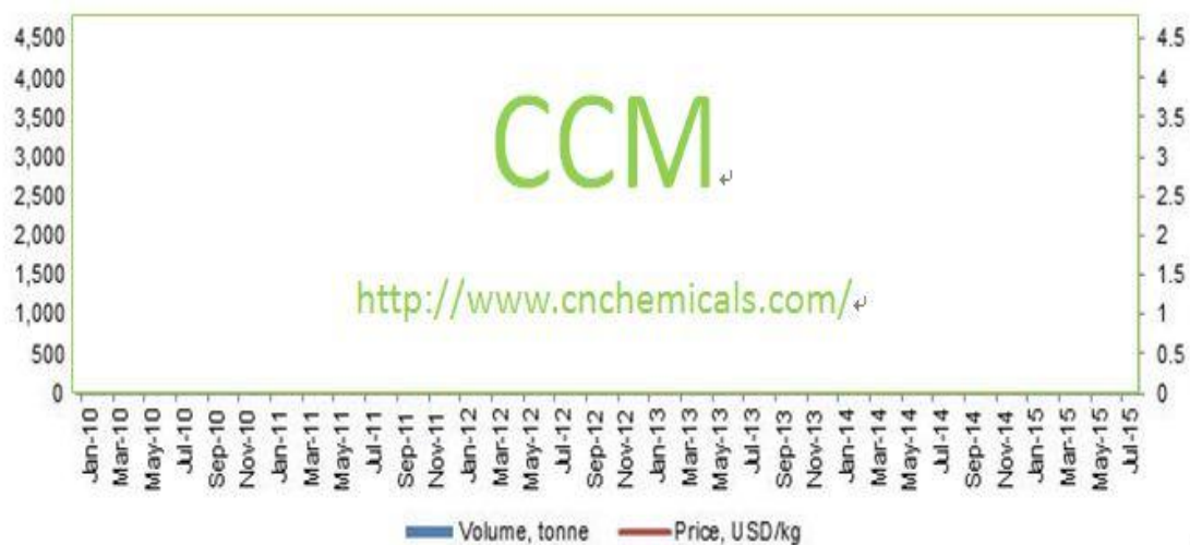
Figure 3.3-2 Monthly export volume and price of yellow phosphorus in China, Jan. 2010-July 2015