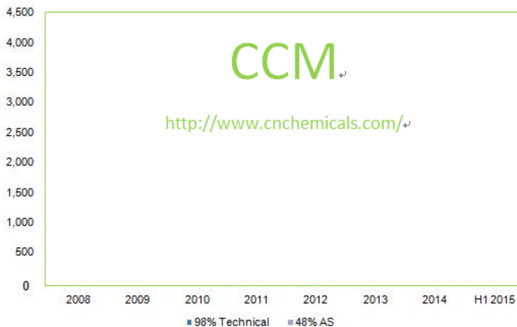
Figure 2.3-1 Export volume of dicamba technical and dicamba formulations in China, 2008-H1 2015, tonne

Note: In 2012, China's dicamba suffered downtrend in its export volume; that's mainly because the major dicamba supplier, Shenghua Biok, suspended one of its production lines which led to a relatively tight supply of the product in China.